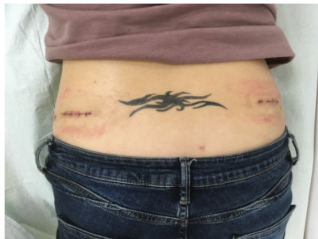
Fig. 2 Wounds after bilateral S3 neurostimulator implantation.

Since the first publication on FS in 1988, it is not clear if FS is an extreme form of dysfunctional voiding with EUS hyperactivity followed by hypotonic bladder or distinct clinical unit. 2 However, every clinician facing unexplained urinary retention in teenage girls and young women should consider