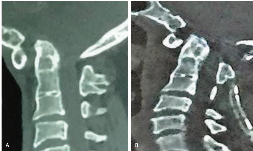
Fig. 2 Case 2: (a) CT sagittal sequence showing BI with AAD. (b) Postoperative CT showing reduction in BI and AAD.