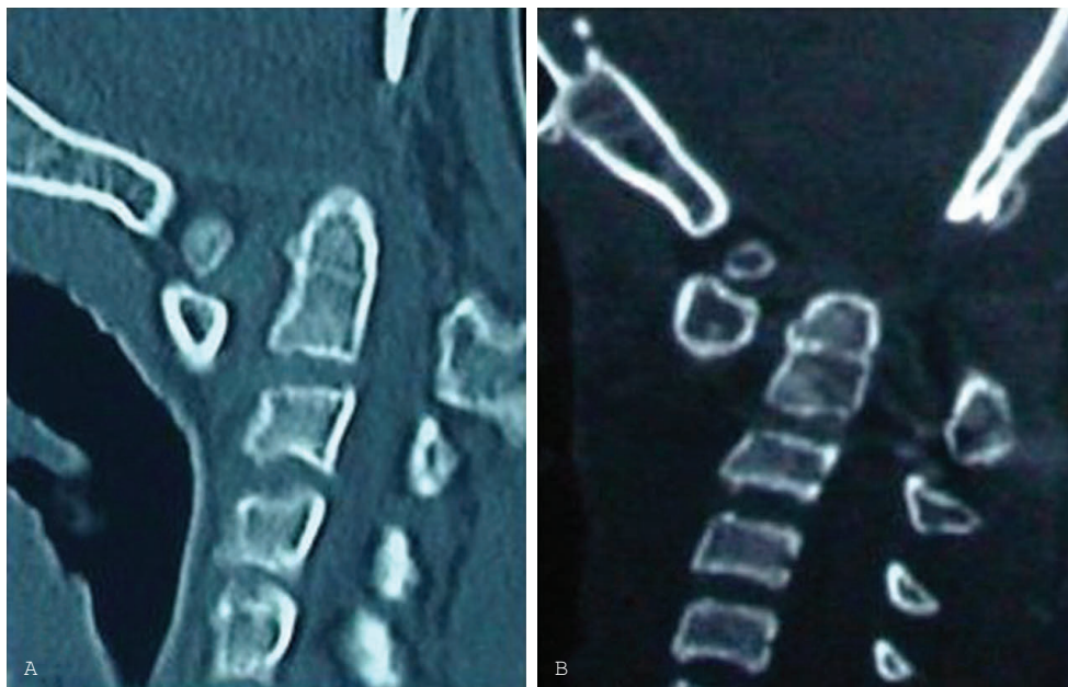
Fig. 3 Case 3: (a) CT sagittal sequence with AAD and BI with Os odontoideum. (b) Postoperative images of CT showing reduction in BI and AAD with foramen magnum drilled.

dislocation. This uses the spacer as a fulcrum and C2 laminar screws as long lever.