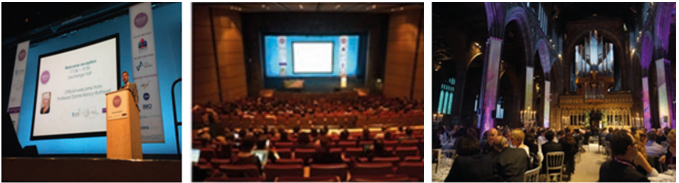
Fig. 1 Opening session (Left and middle) and Gala Dinner at MIE2017