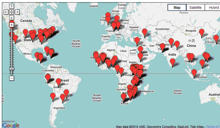
Fig. 3 Geographical Distribution of Known OpenMRS Implementations

OpenMRS has participated in the GSoC programme for the past three years and, in 2010, had one of the highest number of interns funded by Google of any open source project. In 2007,