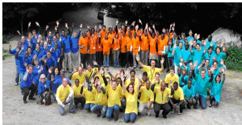
Fig. 2 Group Photograph of Attendees to the 2009 OpenMRS Implementers Network Annual Meeting.

In 2006, the OIN Meeting was structured as a conventional conference with keynote presentations and some unstructured interactive sessions. In response to a requirement for greater attendee participation, since 2007—the format of the OIN Meeting has changed to place a stronger emphasis on discussion sessions and a dynamic agenda. By 2009, the OIN Meeting had adopted a complete un-conferencing format in which the first item on the agenda was to set the agenda. The meeting comprises a minimal number of standard presentations and is mostly made up of sessions requested by the attendees. The format of the sessions includes keynote presentations on selected topics (e.g., State of OpenMRS), discussion fora, fishbowls and technical workshops and is matched to the type of content and participants. In recent years, the OIN Meeting has also increased the technical content with an emphasis on bidirectional interaction between developers and implementers. Attendees to the OIN Meeting include a roughly equal number of implementers and developers.