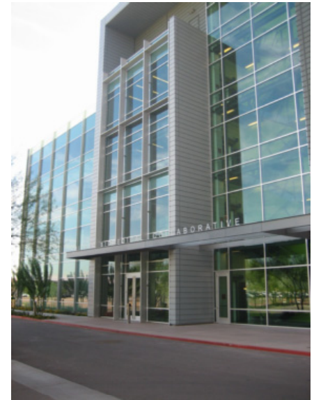
Fig. 1 The new Arizona Biomedical Collaborative-1 building on the Phoenix Biomedical Campus, housing the Arizona State University Department of Biomedical Informatics on the first two floors. The upper two floors are occupied by the Department of Biomedical Sciences of the University of Arizona College of Medicine-Phoenix in Partnership with Arizona State University (COM-PHX).

As mentioned, the PBC also is home to the Translational Genomics Research Institute. (TGen), a non-profit organi-