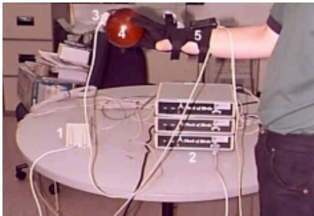
Fig. 3. Main components for motor performance monitoring with patient handling 'real world' object.