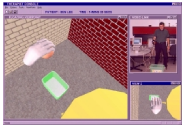
Fig. 4. Screen-shot from the therapist's application showing VR views.

basic biology, those in syndromic disease surveillance require collaboration with medical epidemiologists while those in remote tele-rehabilitation require input from rehabilitation therapists. Nevertheless, these projects fall within the domain of health informatics so long as, according to Haux [15], they "cover computational and informational aspects of processes and structures in medicine and health care".