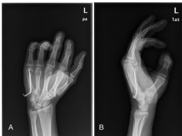
Fig. 1 (A and B) Postoperative X-rays of one of our cases treated with antegrade Kirschner wire pinning.

The data were analyzed with a Mann-Whitney U test, using the SPSS statistical software (IBM, NY).