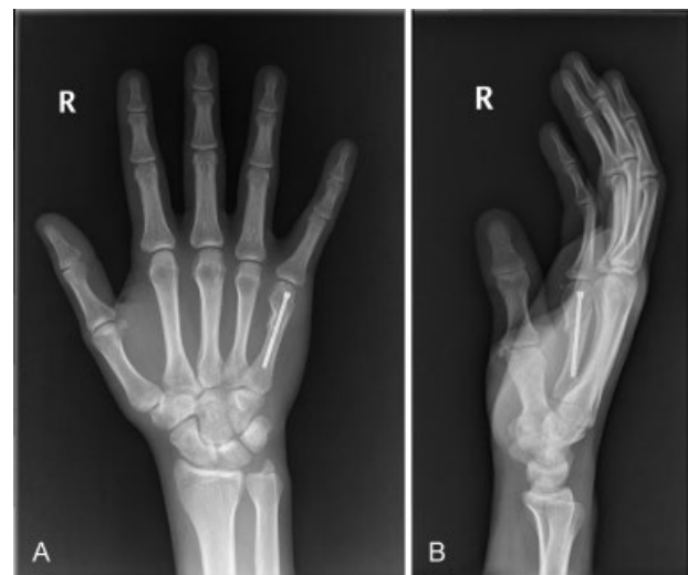
Fig. 2 (A and B) Postoperative X-rays of one of our cases treated with an intramedullary cannulated screw.