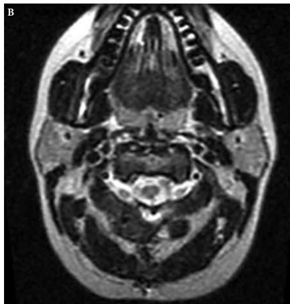
Figure 4A-B (T1) – Weighted sagittal plane and T2-weighted axial plane MRI, respectively, showed complete resection.