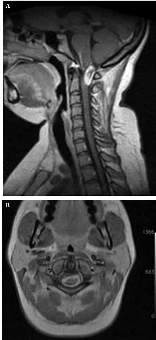
Figure 1 - A (T1) Weighted sagittal plane MRI showing the lesion, enhanced after administration of gadolinium. B (T2) - Weighted axial plane MRI.

After opening of the dura large lesion posterior and to the left of the spinal cord was well visualized dislocating it to the right and anteriorly (Figures 2A and B).