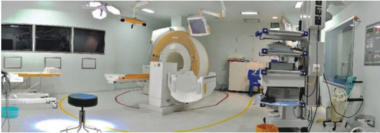
Fig. 1 Intraoperative MRI operating room (“Brain Suite”) at the All India Institute of Medical Sciences, New Delhi. Swivel table can be rotated for shifting patient into gantry, when intraoperative MRI is required. Patient can be operated, beyond the 5 Gauss line (depicted in red color) by usual neurosurgical instruments.

Historically, Boston group led the way for iMRI's use in glioma surgery. 5 Heidelberg group in a later series have clearly documented iMRI's usefulness in optimizing cytoreduction during glioma surgery. 6 Functional navigation and intraoperative high-field MRI (1.5 Tesla) were first used by Erlangen group, and they have also documented additional resection in a series of 47 cases, in which nonidentifiable tumor remnants were initially left. In 36% cases, iMRI led to further continuation of surgery, thus leading to improved EOR. 7 Heidelberg group has reported that the EOR was same when experienced surgeons were compared with less experienced surgeons. In their series of 224 patients, they have reported that in 70% cases they had to continue surgery after the initial MRI. The additional resection after MRI did not lead to more neurologic deficits. Thirty-seven (16.5%) patients had minor or severe permanent deficits. These results are comparable with existing reports in literature. 8 Senft et al 9 have also reported increase in EOR in a randomized trial, in which iMRI utility has been demonstrated. In our initial experience of using iMRI, we have reported “iMRI increased the EOR in 59.7% (40/67) of patients who underwent iMRI.” 10