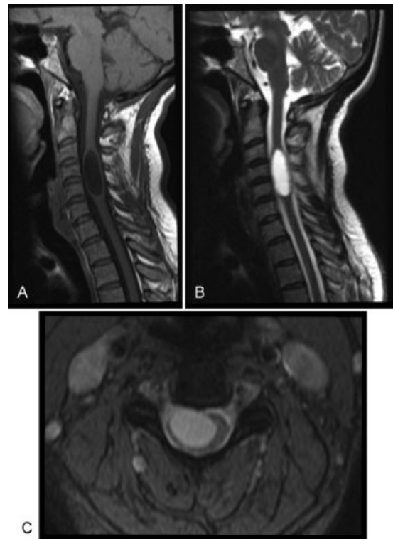
Fig. 1 Magnetic resonance imaging of the cervical spine is demonstrating a 36 × 13 mm intramedullary arachnoid cyst. (A) The lesion is hypointense in the sagittal T1-WI scan. (B) The lesion has a similar intensity of cerebrospinal fluid, but it is hyperintense on the sagittal T2-WI scan. (C) The lesion has a significant mass effect, especially at the C4–C5 level.

The patient continued to improve regarding the radiculopathy and motor power and sensation until fully recovered by the 6-month follow-up period. Serial MRI scan of the cervical spine revealed a progressive decrease of the cyst size, which remained stable at the 2-year follow-up; the shunt tube remained at the same position (► Fig. 3).