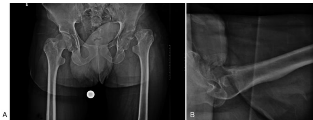
Fig. 1 Anteroposterior weight-bearing radiograph of the pelvis (A) and axial radiograph of the left hip (B) showing a severe necrosis of the left femoral head with deformation and resorption in an inveterate femoral neck fracture.

Despite the young age of the patient, we decided to perform a total hip arthroplasty (THA) through a posterolateral approach. A severe osteoporosis was found intraoperatively with a total resorption of the femoral head (►Fig. 2); therefore, we opted for a cemented stem (MS-30 size 6 with 22 mm/+0 metal head; Zimmer Biomet Inc; Warsaw, Indiana, United States) and a cemented double mobility cup (UHL diameter 44/22 mm; Groupe Lépine; Lyon, France), both fixed with antibiotic-loaded cement (GMV gentamicin cement; Johnson