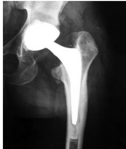
Fig. 4 Anteroposterior radiograph 1 year after surgery shows well-fixed components, no osteolysis, or mobilization of the prosthesis.

93. Improvement in HSS was due only to the “function” and the “deformity” items, pain being an irrelevant item in patients affected by CIPA.