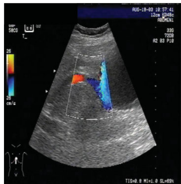
Fig. 2 In the power Doppler mode, the superficial abdominal varices are clearly visible.

approach inappropriate. As a result, a team of gastroenterologists, surgeons, and interventional radiologists met to discuss the most appropriate procedure. In the light of the patient's elevated bilirubin levels (6.9 mg/dL), and fearing the spontaneous rupture of the aneurysm, the decision was taken to lower portal pressure. The implantation of a transjugular intrahepatic portosystemic shunt (TIPS; →Fig. 3a, b) seemed to be the least invasive option. Apart from thrombocytopenia and elevated bilirubin, contraindications for TIPS implantation (hepatic encephalopathy, portal thrombosis, heart insufficiency, pulmonal hypertension, etc.) could be ruled out.