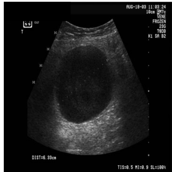
Fig. 1 Under ultrasound examination, an echo-poor formation can be identified as a vessel.

Treatment of the aneurysm was indicated due to the patient's unstable social environment, which put her at risk of recurrent blunt traumata and potentially fatal bleeding. Voluminous abdominal wall collaterals made a laparoscopic