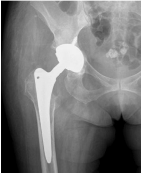
Fig. 2 Postoperative X-ray: a revision with a tantalum cup, reinforced with three screws, with ceramic on ceramic coupling + homologous bone filling of acetabular and trochanteric defects.

The toxicological screening was repeated 1 month after surgery and showed the following results: blood cobalt = 0.15 µg/L; blood chromium = 0.42 µg/L; urine chromium = 0.69 µg/L; urine cobalt = 1.95 µg/L.