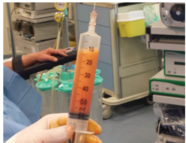
Fig. 4 Fat tissue into the syringe.

In the postoperative period, an abdominal girdle for 15 days was applied to all patients, to reduce the formation of a local hematoma, while a pressure dressing was applied to the knee for 1 day. All the patients followed a rehabilitation protocol to improve posture and muscle toning.