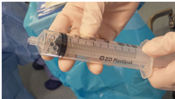
Fig. 1 Sterile Luer-Lock syringe with microspheres.

Fat was harvested from the abdomen using a 2-mm multi-port small-hole cannula and was sheared into finer particles using 60 mL sterile syringe Luer-Lock with microspheres (→Fig. 1). After 7 to 10 minutes of infiltration of the donor site with Klein solution (→Fig. 2), 20 mL of fat was harvested from the abdomen (→Figs. 3 and 4), and after decantation and separation of the liquid component, 6 ml was injected into each knee (→Fig. 5) under local anesthesia. Decanted fat was injected percutaneously with 1-mm cannulas. Percutaneous access to the knee articular space was located at the superior-lateral margin of the patella. Patients were asked to avoid sports activities for 7 days after the treatment.