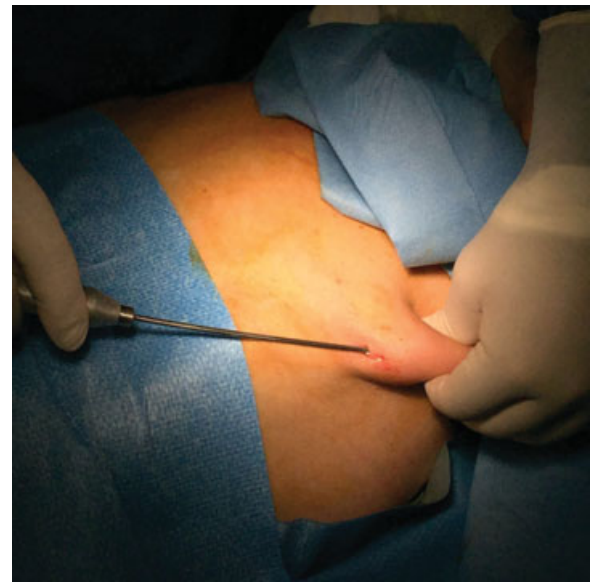
Fig. 3 Fat tissue is taken from the abdomen.

In the postoperative period, an abdominal girdle for 15 days was applied to all patients, to reduce the formation of a local hematoma, while a pressure dressing was applied to the knee for 1 day. All the patients followed a rehabilitation protocol to improve posture and muscle toning.