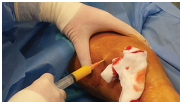
Fig. 5 Fat tissue is injected into the knee.