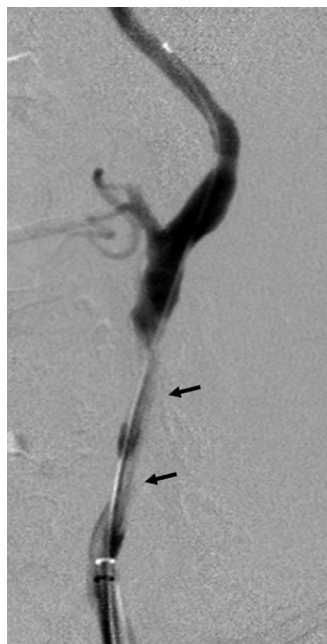
Fig. 2 An angiogram of the left common carotid artery before the procedure, showing multiple segments of strictures (arrows).

Extracranial carotid artery stenosis is a known complication of external irradiation to the head and neck region. Angioplasty and stent placement have low rates of complications and restenosis in the treatment of radiation-associated carotid occlusive disease. 3 The reported procedural stroke rate was 4%. 3