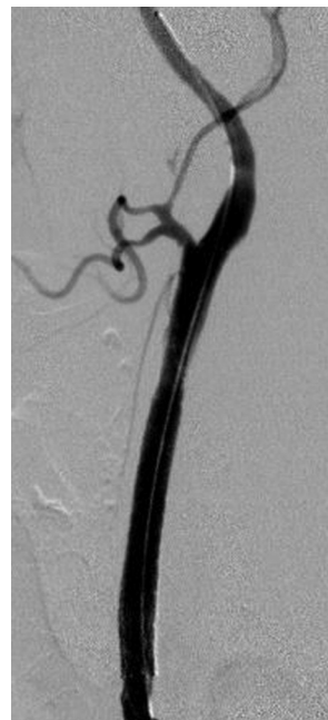
Fig. 3 An angiogram following left common carotid artery stenting and angioplasty showing restoration of the lumen.

Acute neck swelling, immediately after carotid artery stenting, requires evaluation to rule out arterial rupture. There is suggestion of a higher chance of arterial injury related to carotid stenting for radiation-induced strictures. In a case report by Bates and Almekhi et al, a 56-year-old male who underwent carotid stenting for a radiation-induced carotid artery stenosis developed two aneurysmal dilations: one at the proximal edge of the stent that was successfully treated with a stent graft and a second aneurysm proximal to the stent graft for which he ultimately underwent venous bypass covered by a free-muscle graft. 4