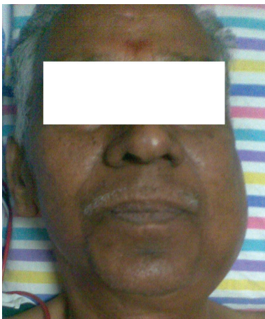
Fig. 1 Photograph of the patient's face showing the ipsilateral (left) parotid region swelling.

and he was managed conservatively. A magnetic resonance imaging with magnetic resonance angiography (MRA) confirmed the findings (► Fig. 4 ). In addition, there was also diffuse soft tissue swelling in the left upper neck, especially in the tonsillar region. The swelling was stable and gradually reduced by the next day. Within 3 days, there was significant reduction of the swelling.