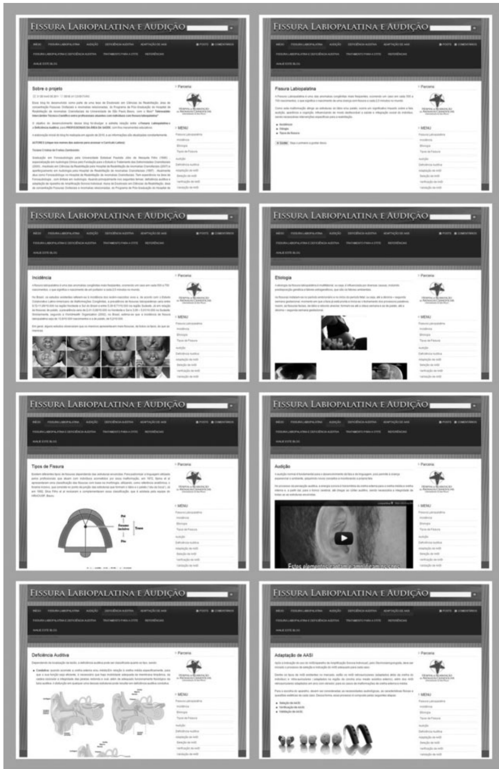
Fig. 1 Blog Fissura Labiopalatina e Audição (Cleft Lip and Palate and Hearing) internal pages with hypertext, images and videos.