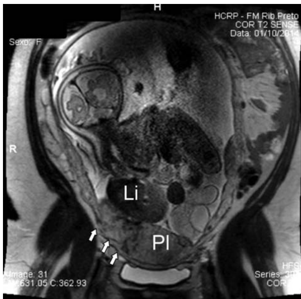
Fig. 3 Fetal MRI image showing severe kyphoscoliosis, liver and intestinal loops out of the abdominal cavity and placenta previa with irregular boundaries with the underlying myometrium (arrows). Abbreviations: PL, placenta; Li, liver.

The descriptive character of this study does not allow us to affirm that there is a causal relationship between poor