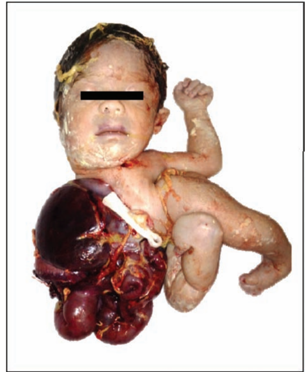
Fig. 4 Newborn photo showing extensive thoracoabdominal defect, serious spine and lower limb tortuosity. Amelia of right upper limb was also observed.

The pregnancy was interrupted at 33 weeks and 6 days. A cesarean delivery was performed followed by a hysterectomy with placenta in situ. Previous to the hysterectomy, an embolization of the internal iliac arteries was performed. The newborn weighed 1,900 g, with undefined sex. It died within a few minutes of life. A large thoracoabdominal defect on the right side and amelia of the ipsilateral upper limb was observed (► Fig. 4 ). The eventration of the abdominal organs with the placenta confirmed the non-obliteration of