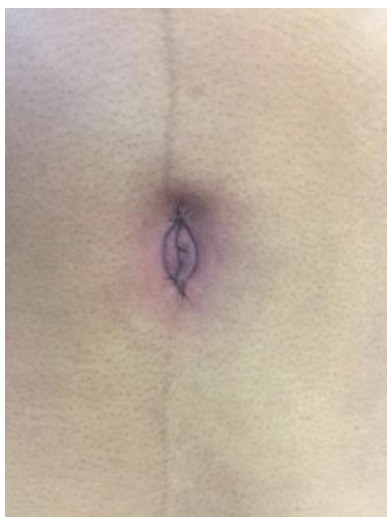
Fig. 4 Umbilicus at the end of the surgery.

Pathological examination: The uterus weighed 85 g and measured 8.8 \times 5.0 \times 3.2 cm. There was bilateral parametrial and vaginal cuff. The gross examination of the specimen revealed an ulcer in the periorificial cervical area (►Fig. 5). The histological examination revealed a histological grade 2 cervical adenocarcinoma measuring 3.0 \times 2.1 \times 1.8 cm associated with multifocal lymphovascular space invasion. The maximum level of infiltration of the cervical wall was 0.7 cm (54% thickness). The parametrial and vaginal cuff as well as the surgical margins were free of neoplasia. There was an intraparametrial lymph node with metastasis. The three