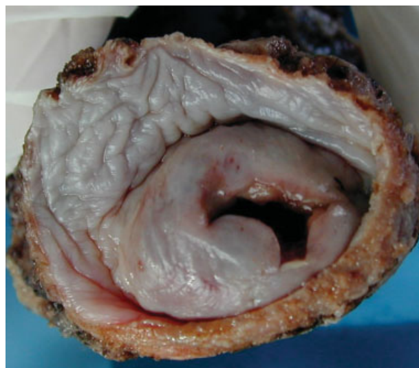
Fig. 5 Surgical specimen: uterus and vaginal margins.

sentinel lymph nodes and the pelvic lymph nodes dissected (8 to the left pelvic chain and 9 to the right) were free, totalizing a nodal status of 1/21.