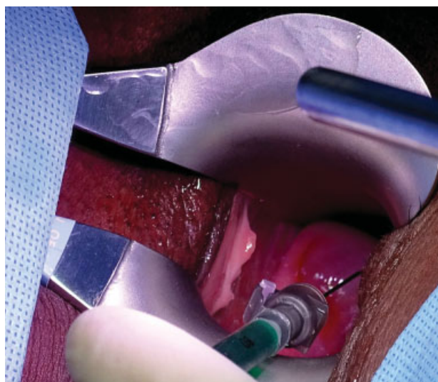
Fig. 1 Cervical injection of indocyanine green (1 ml on each side).

Surgical technique: The patient under combined anesthesia was placed in the semidorsal lithotomy position and then draped. After bladder catheterization, a speculum was placed for cervical visualization, and 1 mg indocyanine green was injected into the cervix (0.5 mg/ml at 3 and 9 hours; ►Fig. 1) in order for the sentinel lymph node mapping to be detected by SPY fluorescence image (SPY System;