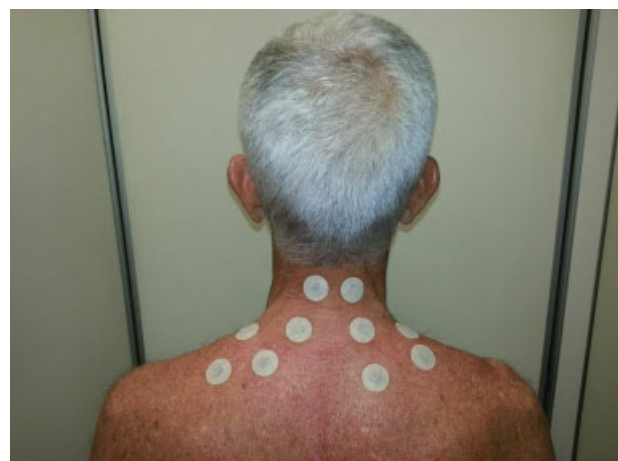
Fig. 2 Distribution of the 10 tablets containing nanotubes.

In a preliminary study conducted before this one, we noticed a decrease in pain and dizziness scores throughout two weeks of patches treatment. Therefore, we tracked out the patient on a biweekly basis. We changed the patches during the first visit, which was 15 days after the beginning of treatment. At this point, one of the subjects was excluded from the study due to patch loss. We recorded the remaining seven subjects pain and dizziness levels using the VAS on a twice week basis. A Computerized Dynamic Posturography (CPD) was performed at the end of four weeks. We plotted sex, age, pain, and dizziness scores in a table. We analyzed