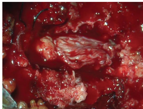
Fig. 4 Intraoperative image showing dural tear and exposed nerve roots.

patient was approached anterolaterally, corpectomy L2 was done, and expandable cage was placed. The patient was thereafter turned prone and posterior approach was taken. Fracture of the spinous process and lamina was confirmed and laminectomy done taking due precautions to avoid injury to avulsed nerve roots. The dura was found torn and the nerve roots had avulsed. The nerve roots were found to be wedged inside the fracture of spinous process and were released. The nerve roots were repositioned and the dura closed primarily. The patient was followed up closely and over a period of 3 months, and he showed steady improvement (→Table 4).