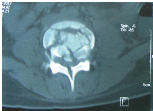
Fig. 3 NCCT axial section showing canal compromise and fractured lamina.