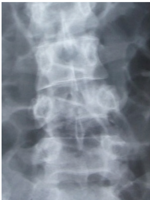
Fig. 1 X-ray AP view showing widening of the interpedicular distance.