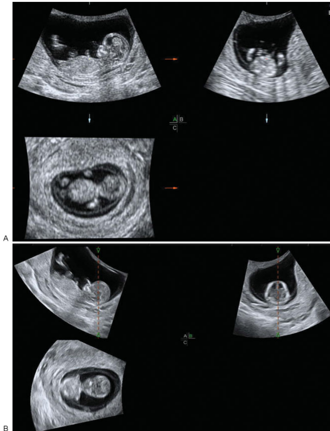
Fig. 1 (A) Three-dimensional volume of a normal first trimester fetus at 12 weeks 4 days displayed in the three orthogonal planes. (B) The reference dot is moved to the fetal head and rotation is performed along the three axes to optimize the plane of the fetal biparietal diameter in plane B. Virtual organ computer-aided analysis is activated using plane B as the reference plane with a rotational angle of 30 degrees along the Y axis. (C) Upon completion of six manual traces at 30 degrees along the Y axis, the volume of the fetal head is automatically generated.

agenesis, left atrial isomerism, situs inversus, single umbilical artery, holoprosencephaly/proboscis, and omphalocele. Of the 19 fetuses, 2 were live born (10.5%). Termination of pregnancy was performed on 13/19 (68.4%). There was spontaneous in utero demise in 2/19 (10.5%). In addition, 2/19 (10.5%) were lost to follow-up. A complete summary of the 19 cases is presented in ► Table 2 .