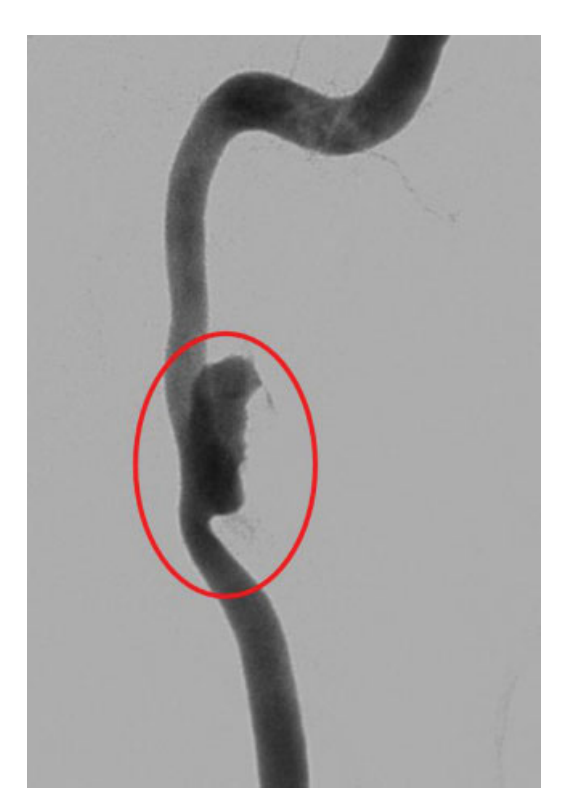
Fig. 3 Digital subtraction angiography confirms the internal carotid artery pseudoaneurysm.