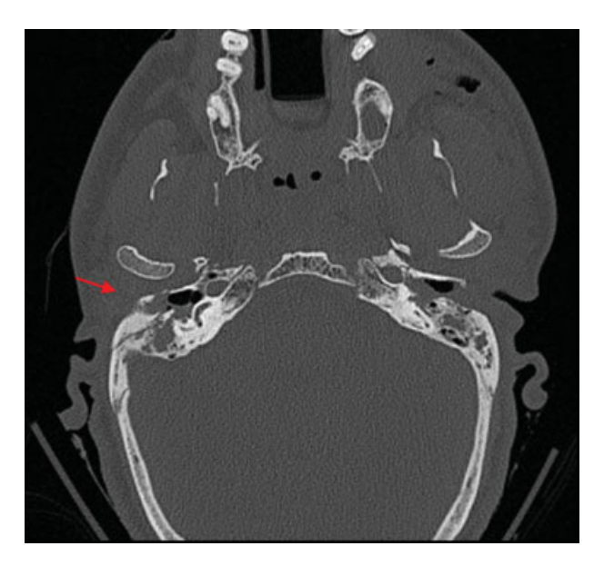
Fig. 1 Computed tomography shows mastoid fracture with extension to the external auditory canal (arrow).

and final checks showed regular flow in the ipsilateral carotid vessel. During the 2-year follow-up, there were no further morphologic changes of the PSA.