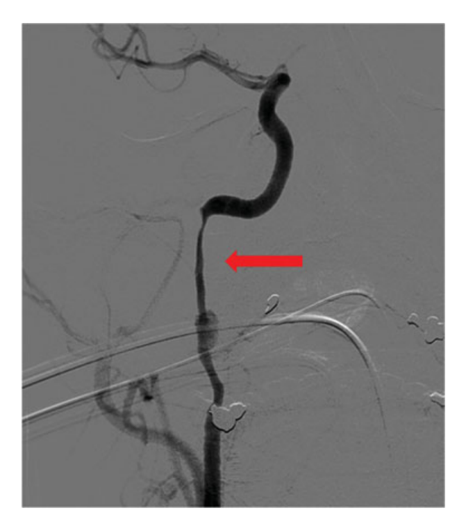
Fig. 4 Stent placement procedure. Arrow shows remaining contrast enhancement in the pseudoaneurysm side.