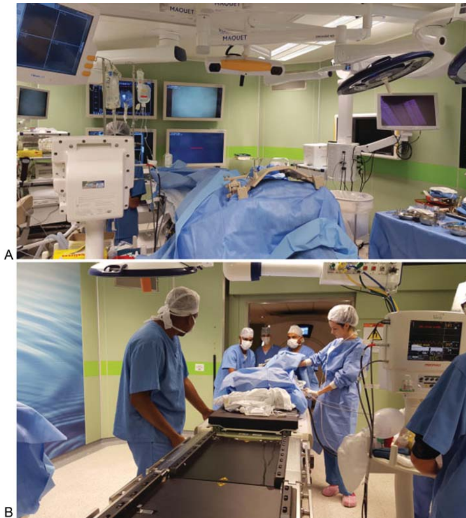
Fig. 1 (A) Surgery in the hybrid room, preparing the patient for intraoperative magnetic resonance imaging, with neuronavigation. The surgical site is covered with new sterile fields, the coils are coupled, as well as the device for immediate neuronal navigation with the new images to be obtained. (B) With the attached room door open, the special magnetic resonance transport stretcher is connected to the surgical table for direct transport of the patient to the apparatus by sliding.

pressure (ICP), partial tissue oxygenation (PTiO 2 ), point of care ultrasonography and pulse contour cardiac output (PiCCO) monitoring. Equally important is the presence of active teams of respiratory, motor, and day and night phonoaudiology.