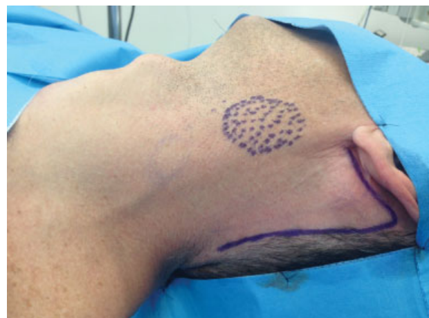
Fig. 1 Retroauricular incision planning.

Patient preparation for surgery was the same as that which is typically used for other neck surgeries performed under general anesthesia. The patient was positioned at the operating table with cervical extension and contralateral head rotation. The surgeon performs the retroauricular incision (→Fig. 1) and raises the subplatysmal skin flap exposing the surgical field limited by neck midline, lower mandible border, omohyoid muscle, and esternocleidomastoid muscle, as described at Yonsei Medical Center Head and Neck Department in Seoul. 15,16,22 During flap elevation, it is important to identify and preserve the great auricular nerve and external jugular vein. Then, a Thompson self-retaining retractor (Thompson Surgical Instruments, Traverse City, U.S.A.) was applied establishing the proper working space. Neck dissection (→Fig. 2), submandibular or neck mass excision was then performed with assistance of an ultrasonic scalpel (Ultra-cision ACE, Johnson & Johnson, U.S.A.), vascular clips (Hem-o-lock, Teleflex, Morrisville, U.S.A.), a 10mm, 30-degree endoscope, and usual laparoscopic instruments (Grasper and Maryland forceps). The surgeon performed any dissections lateral to the carotid artery under direct vision using headlights, albeit without magnification tools, and regular surgical instruments, before introducing the endoscope. Routine dissection and preservation of facial marginal branch, vagus, hypoglossus, lingual, accessory, and phrenic nerves were