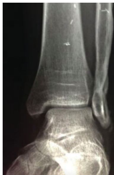
Fig. 4 Case 2: 7-year postoperative X-rays in frontal view.

allowed a good anatomical support to the remaining osteochondral part of the lateral malleolus.