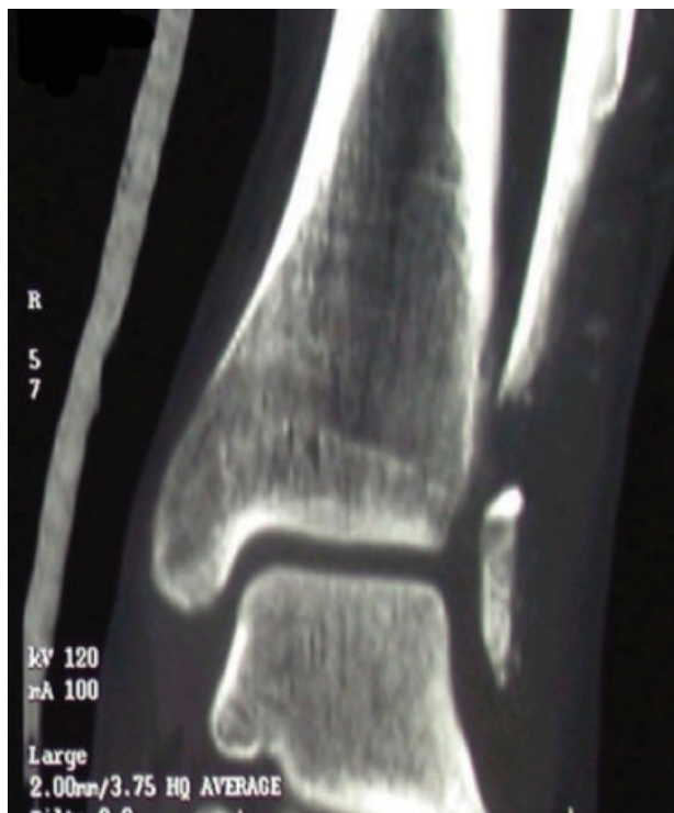
Fig. 1 Case 1: preoperative computed tomography in frontal view.