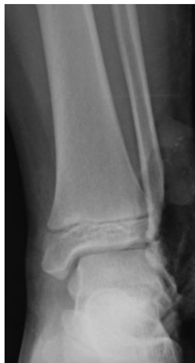
Fig. 3 Case 2: preoperative X-rays in frontal view.