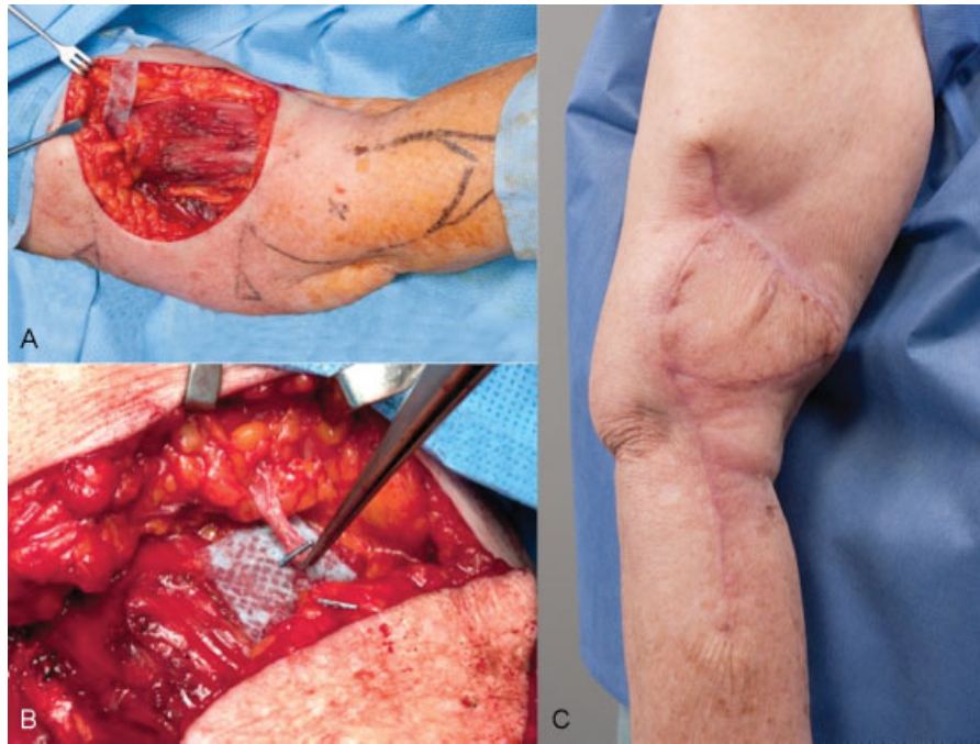
Fig. 3 A, B Forearm RCAP flap for reconstruction of upper arm defect based on perforator next to lateral epicondyle, rotated into upper arm defect. Branch of cephalic vein dissected as a recipient for venous supercharging. C Flap healed with full range of motion in elbow on follow-up.

admission and flap observations. We propose the prophylactically venous supercharged RCAP propeller flap as a safe and reliable option in reconstructing challenging defects in the arm, forearm, and elbow region.