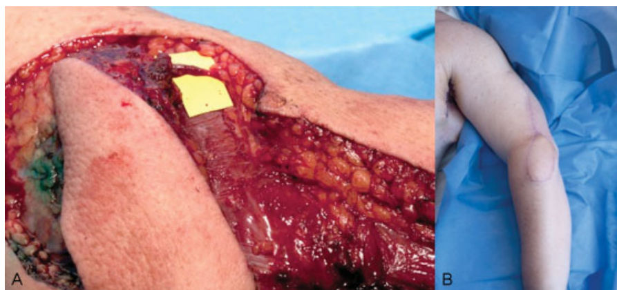
Fig. 2 A Prophylactic venous supercharging of RCAP flap by anastomosing superficial vein at the tip of the flap with superficial vein on the dorsal forearm following flap rotation. B Excellent functional and aesthetic outcome at 6-month follow-up.