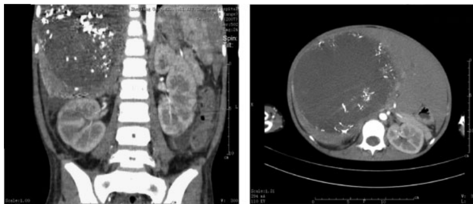
Fig. 2 The tumor shank 4 weeks after TACE of case 1. TACE, transarterial chemoembolization.

transient liver dysfunction including the rise of ALT (63 U/L) for 1 week, without cardiac, leukocytopenia, or renal dysfunction, and these symptoms showed dramatic improvement after symptomatic treatment. Four weeks after TACE, abdominal ultrasonography and CT scan showed that the tumor volume decreased by 31% and the blood flow of the tumor was clearly lower than before treatment (→ Fig. 2 ).