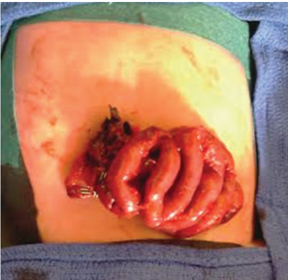
Fig. 2 Macroscopic image of the intestines after tissue plasminogen activator treatment.

Following surgery and after parental consent, thrombolysis was initiated 24 hours after the second look laparotomy to promote clot dissolution according to a previously reported protocol. 3 This consisted of a combination of t-PA at a dose of 0.25 to 0.5 mg/kg per hour for 6 hours, and fresh frozen plasma to increase plasminogen to potentiate the action of t-PA. In addition, low-dose anticoagulation was provided by administering unfractionated heparin (range, 15–20 U/kg/h) for a total of 24 hours. No apparent adverse effects were noted and cranial ultrasound was normal before and after thrombolysis.