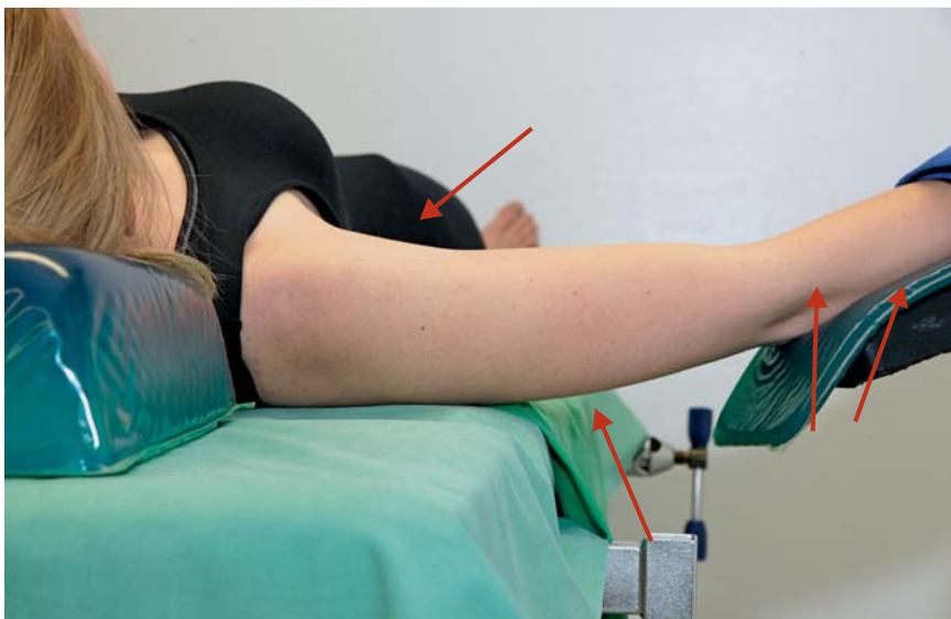
Fig. 1 Prevention of neuropathies of the upper extremities (1); optimize positioning of the shoulder to prevent brachial plexus injury or ulnar neuropathy.