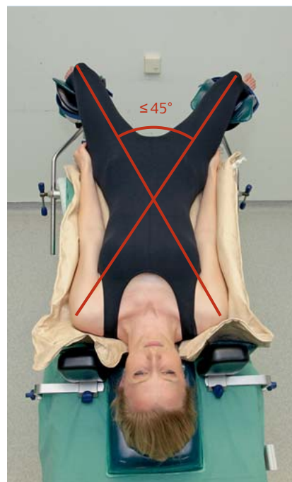
Fig. 5 Prevention of neuropathies of the lower extremity (1): ensure correct leg abduction to prevent traction of the obturator nerve.