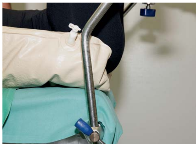
Fig. 7 Prevention of neuropathies of the lower extremity (3): ensure optimal positioning of the sacrum in the lithotomy position.

tive positioning-related obturator neuropathy after cesarean section.