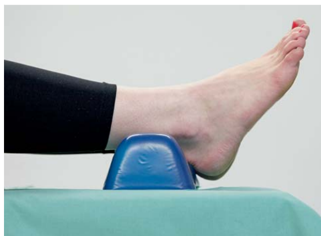
Fig. 8 Aspects of pressure ulcer prevention.

High-frequency surgery is used in most gynecological procedures for cutting or coagulation. High-frequency alternating current flows from the active electrode through conductive tissue to a larger passive electrode (neutral electrode) which conducts the current back to the high-frequency unit again, thereby closing the electric circuit. Thermal energy is created at the point of contact between the active electrode and the tissue, which creates the desired cutting or coagulation effect. Technical or operating mistakes and surgery- or patient-related factors (e.g. uncon-