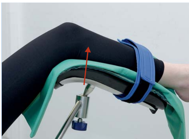
Fig. 6 Prevention of neuropathies of the lower extremity (2): place the lower leg in padded stirrups.