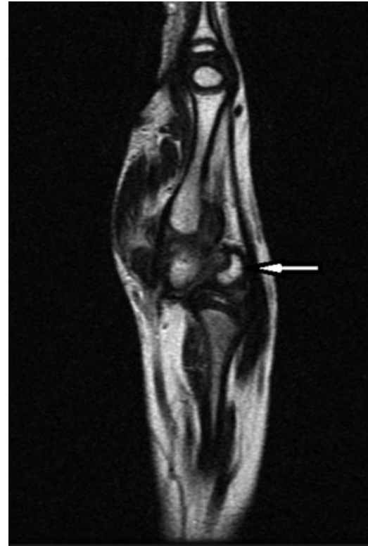
Fig. 2 Magnetic resonance imaging before surgery. Perilunate wrist dislocation lateral view.

Because of the extremely rare type of the trauma and its being chronic in nature, the administered treatment and the