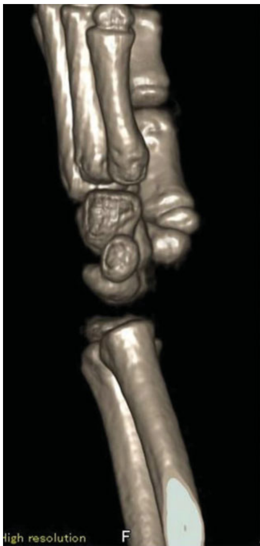
Fig. 4 Computed tomographic scan after surgery, lateral view.

apparent lack of any previous reports of this kind. However, medical literature amply describes acute perilunate dislocations 2,4-7 which allows for a comparison of the type of symptoms, diagnosis, injury mechanism, treatment, effects, and further prognosis.