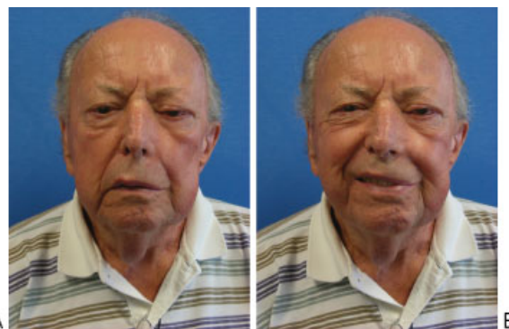
Fig. 5 (A, B) Demonstration of dynamic result after orthodromic temporalis tendon transfer.

The previously vascularized ALT free flap is now draped over the nerve anastomosis within the parotid bed and the flap is circumferentially suspended to SMAS and deep soft tissues. If