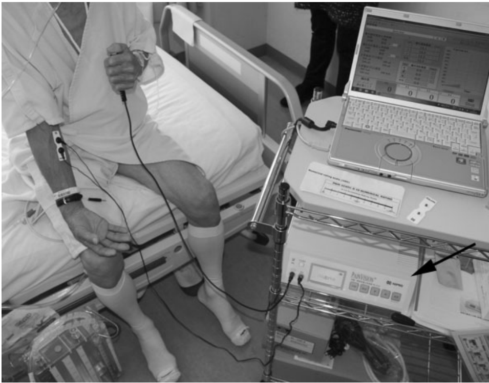
Fig. 1 Pain Vision (arrow) was used to measure postoperative chest pain by assessing current perception threshold (CPT) on POD 2.

patient perceives as equivalent in strength that of the postoperative pain, causing the patient to worry. The pain score was calculated as follows: (PET - MPT) / MPT . If no pain existed, this value was 1 and increased with the degree of pain, without an upper limit.