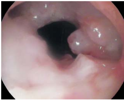
Fig. 2 Endoscopic view of complete embedding of the proximal cup of the Ultraflex stent. The reactive inflammatory tissue completely overlaps the uncovered proximal portion of the mesh (100% circumferential ingrowth).

ed in four procedures, and a fully covered nitinol stent (Wallflex) in two. All stents were left in place for a median of 9 days (range 6–17). In four patients, the stents were successfully removed at the planned date (● Fig. 3). In the patient with esophageal tumor, it was decided to remove the stent because of the onset of dyspnea related to extrinsic compression of the trachea and left main bronchus. In one patient, complete embedding of the proximal end of the first stent was seen after removal of the second fully covered stent at 17 days after implant. Another partially covered nitinol stent was then placed, and both stents were easily removed after 6 days. The procedural time for removal varied between 20 and 30 minutes.