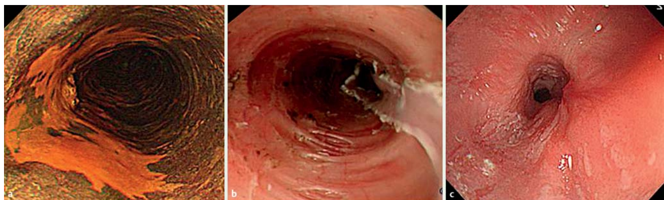
Fig. 2 Endoscopic views of the esophagus in a typical stricture case in the ESD alone group. a Chromoendoscopy with iodine staining revealed a discolored area in the mid-thoracic esophagus. The superficial esophageal cancer extended over three-quarters of the circumference. b Artificial ulcer immediately after endoscopic submucosal dissection (ESD), which resulted in a mucosal defect affecting more than three-quarters of the circumference. c Emergency endoscopy revealed a stricture 2 weeks after ESD. The patient experienced severe dysphagia.

portant that oral prednisolone is administered as soon as possible for the best outcome after ESD.