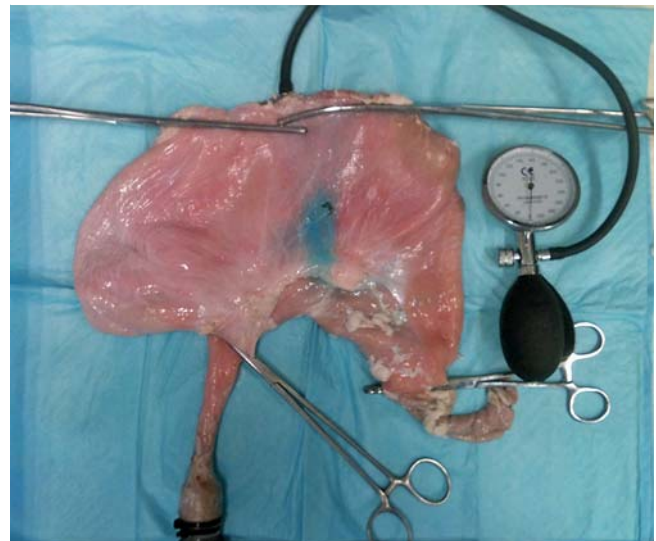
Fig.3 Air-leak pressure evaluation. Surgical clamps close the stomach and the duodenum. Needle connects to the manometer.

Data were presented as mean ± standard deviation and were evaluated for statistical significance by using StatPlus for Macintosh software (AnalystSoft Inc., Alexandria, VA, USA). Statistical comparisons were made among the different groups by using a Student t test and statistical significance was defined as P \leq 0.05 .