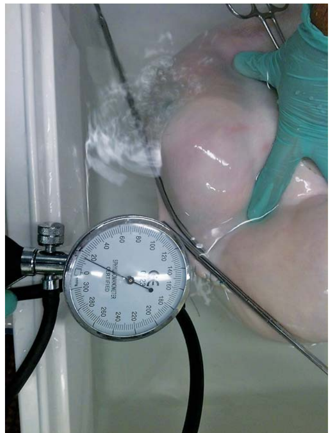
Fig.4 Air-leak measurement procedure with the manometer and the two needles.