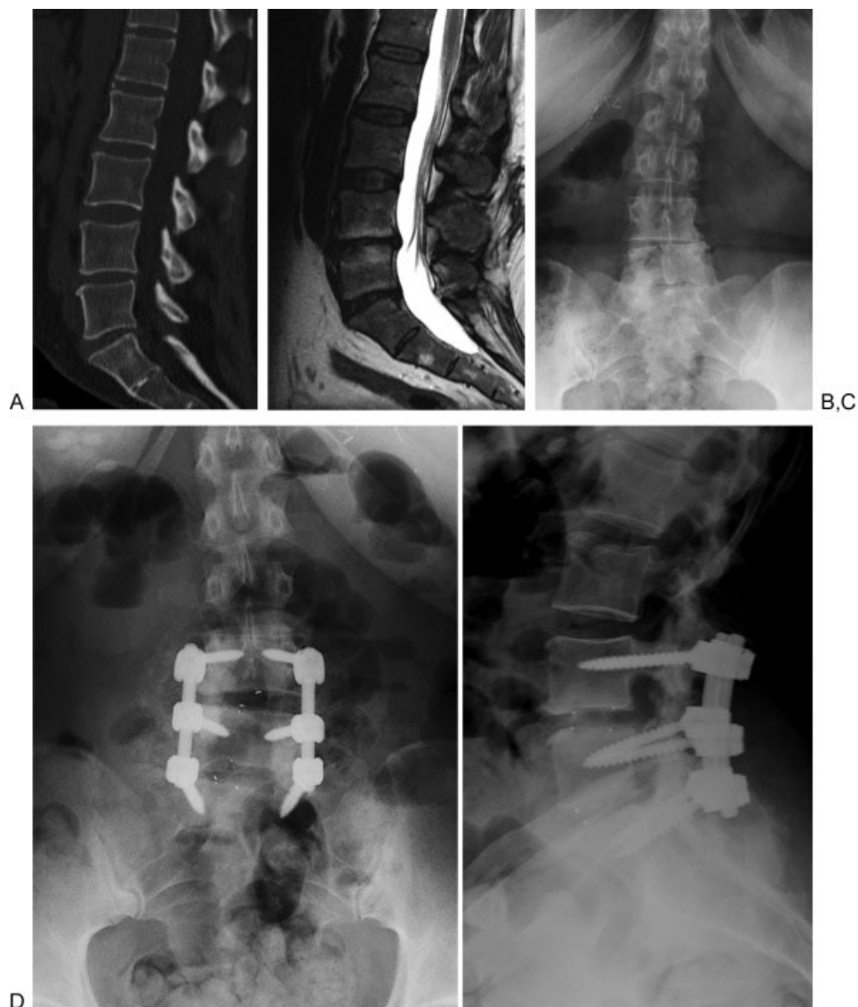
Fig. 3 A 45-year-old female patient presented to the physician office complaining of lower back pain (VAS: 10/10) radiating to the right lower extremity (VAS: 9/10), and a sensory deficit in the L5–S1 distribution. (A) A preoperative computed tomography (CT) imaging study depicted a lumbar disc herniation with central disc protrusion at the L5–S1 level, in addition to a mild retrolisthesis. The patient underwent a single-level microdiscectomy at L5–S1 supplemented by fat-graft placement, and was discharged after 2 days. At her first postoperative office consultation, the symptoms of a sensory deficit in the L5–S1 distribution had resolved, and her back and leg pain had improved, with VAS scores of 4/10 and 1/10, respectively. Due to recurrent radicular symptoms, a magnetic resonance (MR) image was performed 39 months after the index microdiscectomy, which depicted a right paracentral disc herniation at the L5–S1 level, in addition to a severely decreased disc height with posterior bulging of the L4–L5 disc (B) causing mild thecal sac compression, and a slightly progressive right scoliosis with 12 degrees, measured between L1 and L5 (C). Forty months after the initial microdiscectomy at L5–S1, the patient underwent a posterior decompression from L4 to S1, neurolysis of the L5 and S1 nerve roots, bilateral lateral fusion and posterior instrumentation from L4 to S1, as well as two-level posterior lumbar interbody fusion at L4–L5 and L5–S1 (D). At a postoperative telephone follow-up of 78 months, the reported VAS scores for back and leg pain were both 1/10 with an absence of other radicular symptoms apart from back or leg pain.

Finally, with regard to the subanalysis comparing patients with and without a reoperation after the index microdiscectomy, it needs to be stated that patients in the reoperation subgroup may have a poorer long-term outcome either because they had a reoperation or because they had greater disability or more advanced disease at baseline. In fact, it appears that the reoperation subgroup presented with a trend toward a higher back pain severity already in the preoperative setting. Follow-up studies with available preoperative ODI scores and a larger sample size are warranted to investigate the trend toward a poorer clinical