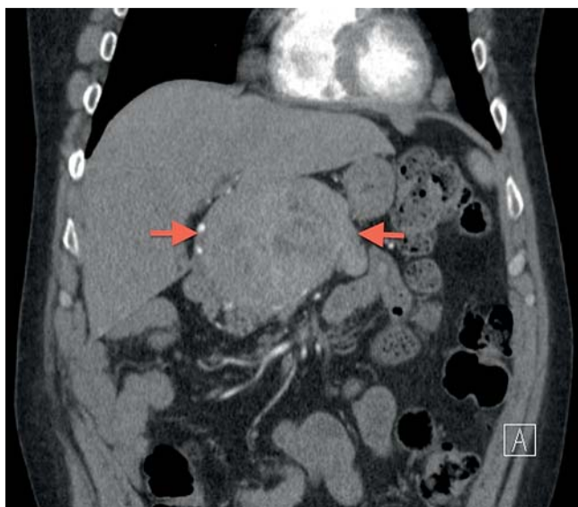
Fig. 1 Coronal abdominal computed tomography (CT) image performed before initial endoscopic ultrasonography with fine needle infusion (EUS-FNI) revealed a large 9.0×11.4 cm porta hepatis tumor (red arrows).

At the initial EUS-FNI, the large porta hepatis mass, which compressed both the extrahepatic biliary system and stomach, was evaluated via linear echoendoscope and a 22 gauge needle was introduced through a Doppler free window which was then used to perform three passes through the right, center, and left side of the tumor infusing 1 mL of 98% ethanol with each pass with 3 mL used in total (► Fig. 2 ). A repeat computed tomography (CT) scan 6 weeks later revealed minimal tumor reduction with a small central area of necrosis and the patient experienced no improvement in clinical symptoms.