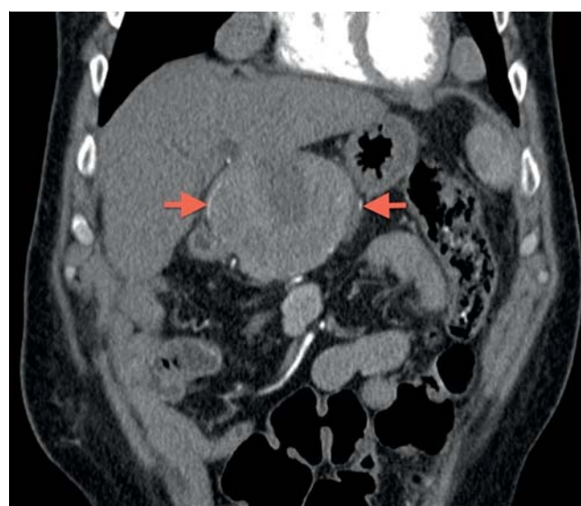
Fig. 3 Coronal abdominal computed tomography (CT) image performed 3 months after second endoscopic ultrasonography with fine needle infusion (EUS-FNI) revealed a 36% reduction in tumor size, now measuring 6.7×9.8 cm (red arrows) with area of central necrosis.