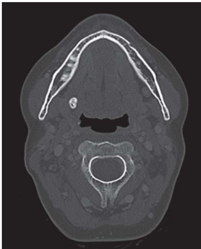
Fig. 3 For detecting especially small concretions, CT imaging is superior to MR imaging. Here a large submandibular concrement is visible.

with acceptance of the radiation exposure. CT or MRI imaging is used for determining infiltration depth in the case of neoplasias. Concretions can be delimited in particular with radiation-based methods, while MRI is the most reliable method for detecting soft tissue changes (► Fig. 3). The rarely indicated scintigraphy with Tc-99 pertechnetate is available as a functional imaging method which provides very good assessability of salivary gland functioning but has only limited morphological significance [11]. It is not used in cases of acute obstructive sialadenitis but rather in post-therapeutic situations, for example after the treatment of obstructive sialadenitis, external radiation, or radiotherapy [12].