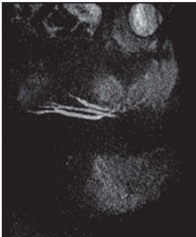
Fig. 1 The MIP reconstruction of strong T2-weighted sequences allows illustration of the excretory duct: 36-year-old patient with a widened tripartite parotid duct due to distal stenosis