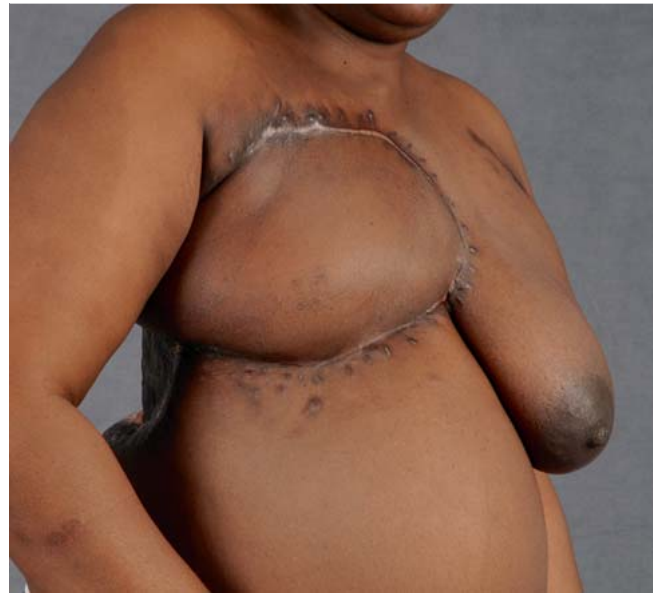
Fig. 11 Postoperative situs after pedicled latissimus flap-plasty with complete healing of the skin graft.