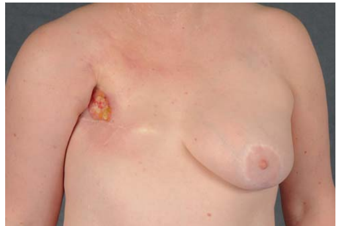
Fig. 16 Preoperative situs of a patient, condition after ablation of the right breast for carcinoma and ulcerated axillary metastasis.