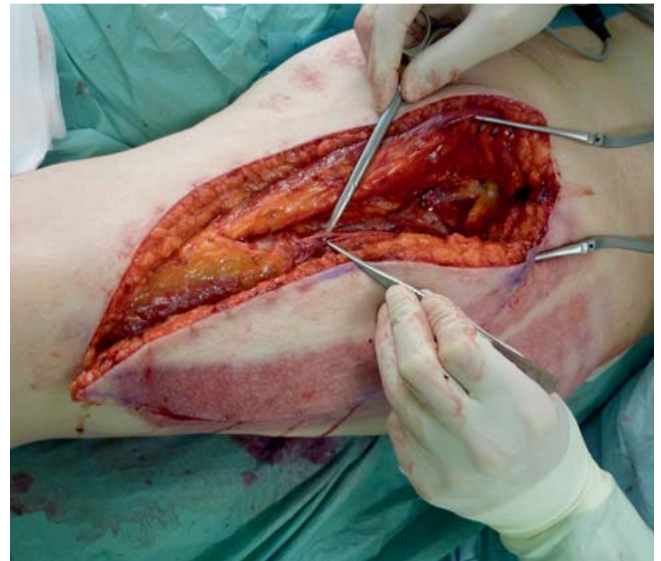
Fig. 14 Lifting of an anterior-lateral-thigh-flap (ALT) with view of the supply perforator vessel (the colour and texture change is caused by a prior split skin removal).