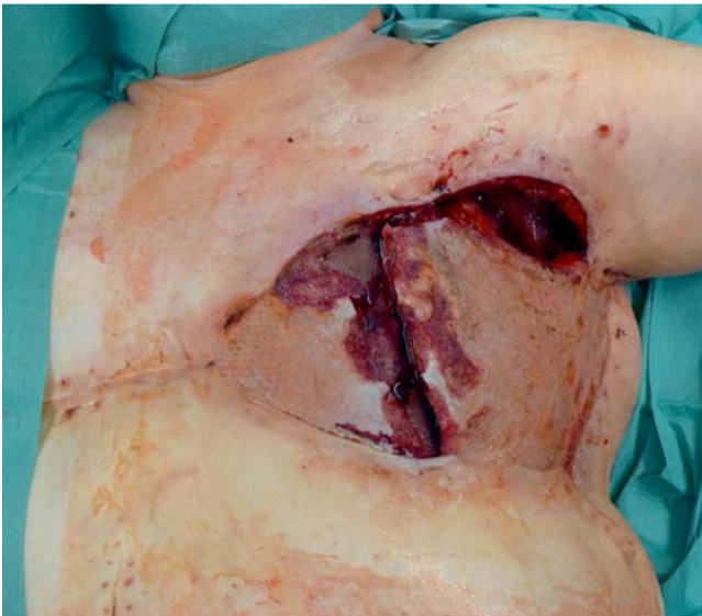
Fig. 13 Wound healing disorder following ablation of the breast in the case of carcinoma and defect coverage by means of VRAM and pedicled latissimus dorsi flap-plasty. In this the flaps were lifted simply as muscular flaps without a skin paddle, something which we advise against on account of the higher complication rate and the smaller size of the flaps.