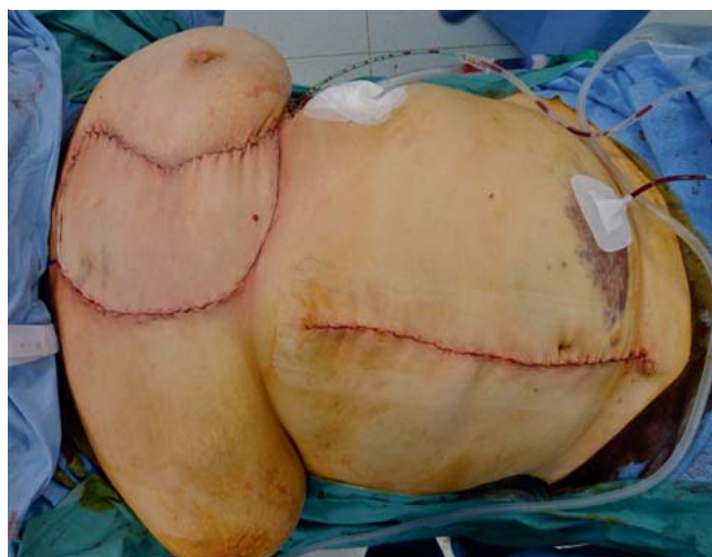
Fig. 5 Coverage of the defect using a pedicled VRAM-flap.

In the case of this flap-plasty, the perfusion also takes place via the superior epigastric vessels which are, however, weaker in