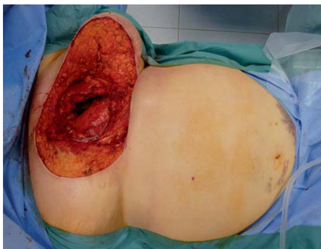
Fig. 4 Intraoperative situs following radical resection involving the sternum.

Pectoralis major flaps are, however, only used in the reconstruction of the thoracic wall following tumour resection under certain circumstances. Firstly, the size of the skin graft is very limited in the case of a myocutaneous flap and, secondly, the vascular structure of the flap is often impaired by prior operations, the progression of infections and radiotherapy because of where it is located.