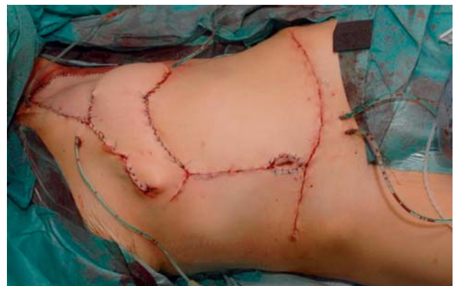
Fig. 9 Situs after anchor flap is sewn in and donor site has been closed by means of an abdominoplasty with umbilical repositioning.

comparison to the inferior epigastric vessels. So, in the case of a cranially pedicled flap from the lower abdomen, perfusion disorders and partial necrosis can occur, particularly in the lateral portions.