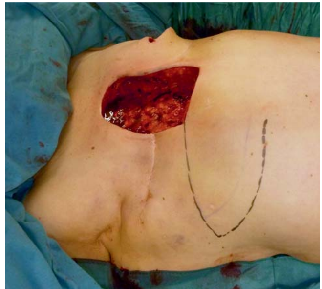
Fig. 2 Intraoperative situs following the resection of the finding and planning of a thoracoepigastric flap.