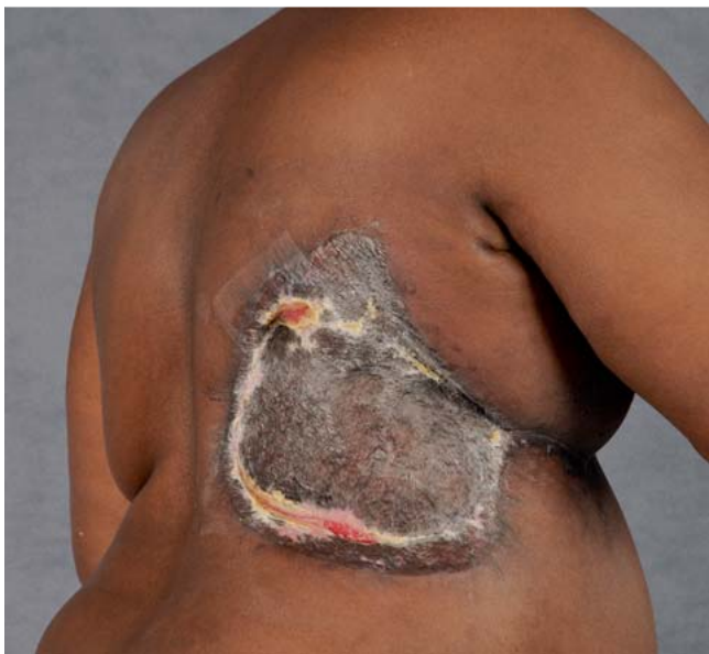
Fig. 12 Donor site of the latissimus flap which required split skin graft due to the size. There are wound healing complications cranially and caudally which underwent conservative treatment.

Whether or not the omentum is the desired size cannot be determined until after opening up the abdominal region. Occasionally, adhesions must be painstakingly removed and the net raised from the stomach in order to achieve the appropriate rotational radius. Furthermore, a gap must remain in the abdominal wall so that the pedicle can be guided outwardly through it in the direction of the thoracic wall. Even though such a fear of a “two-cavity-operation” is over-exaggerated, this flap should only be lifted with the relevant experience and any potential complications such as intestinal perforations and bleeding can be contained. Due to its great plasticity, the omentum is well placed for