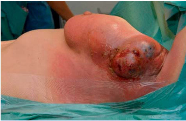
Fig. 6 Preoperative ulcerated breast carcinoma finding.