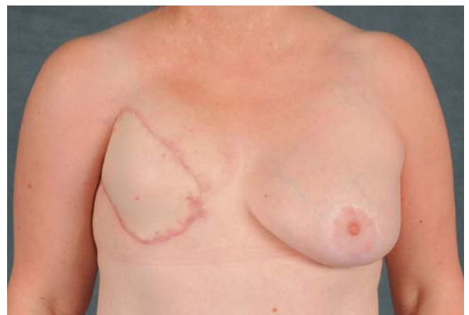
Fig. 17 Postoperative situs after defect closure with DIEP.