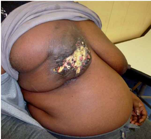
Fig. 10 Preoperative situs of a patient with ulcerated breast carcinoma.