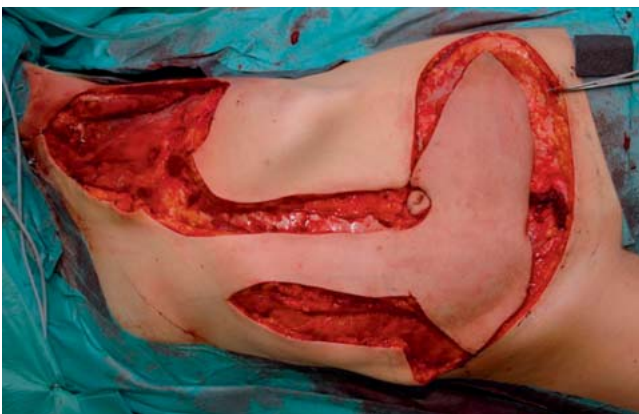
Fig. 8 Situs following resection of the tumour and lifted anchor flap.