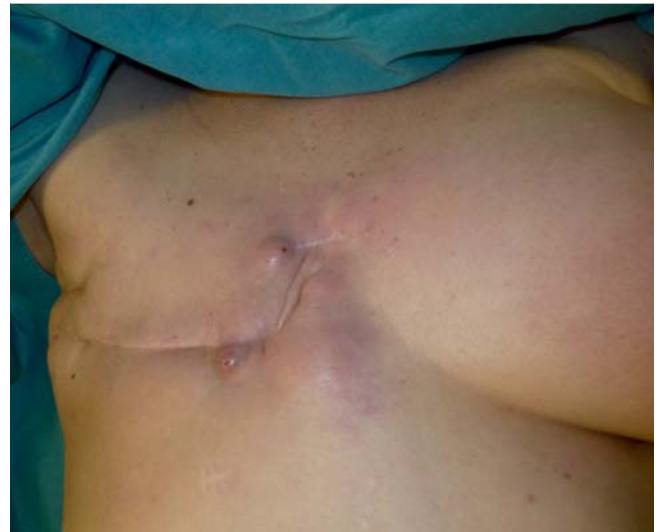
Fig. 1 Preoperative situs of a patient with recurrent breast cancer following an ablation.

• Figs. 1 to 3 show a thoracoepigastric flap graft being carried out in a patient with recurrent breast cancer following an ablation.