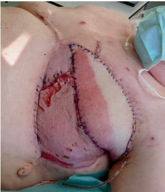
Fig. 15 Postoperative situs with well-supplied ALT flap-plasty and successful defect closure.