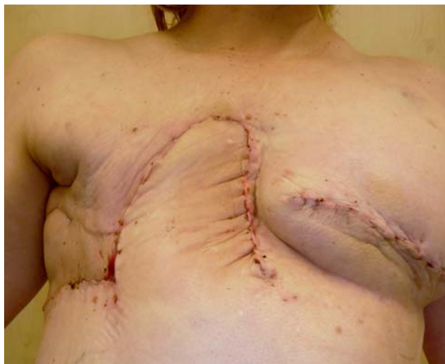
Fig. 3 Postoperative finding with fully healed flap-plasty and stable defect coverage.

of aesthetics, it has an insecure blood supply and partial flap necrosis could result from venous insufficiency, which is why we only use it in certain cases. As a flap which is simply muscular, the pectoralis major can be removed from the thoracic wall as a “sliding pectoralis flap” and, to gain more rotational freedom, it can be removed from the clavicle and the humerus too. In this case, it remains pedicled to the pectoral branches of the arteria thoracoacromialis and can thus be transposed to the defect requiring coverage [21,22]. Upon lifting the muscle, there is only a moderate loss of strength [20].