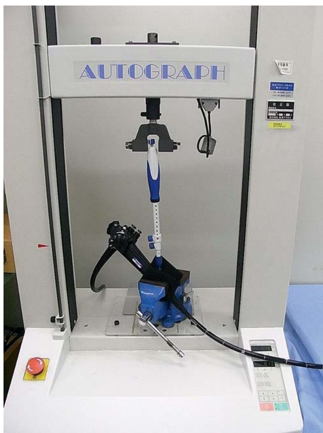
Fig. 3 Autograph equipment for examination of resistance to needle insertion.

geted lesions depends on both the flexibility of the scope and the direction of the ultrasound probe. The direction of the ultrasound probe differs between the Pentax and Olympus echoendoscopes, which have a side and an oblique direction, respectively, for the ultrasound beam direction. Therefore, the actual differentiation between the standard Pentax and Olympus scopes may be unclear because we did not image any real lesions by means of EUS with a 19G needle. The diagnostic slim Pentax echoendoscope (EG-3270UK) showed comparatively lower scope angulations than others. These data suggest that the standard large-diameter EUS scope has a robust wire that enables the large tip of the endoscope to be safely bent, while the diagnostic slim echoendoscope does not have a such a robust wire. That may lead to lower angulations when the 19-gauge needle is used. Since the needle angulation (angle B) is the most important parameter for various interventional EUS procedures, the Pentax slim echoendoscope in combination with a 19-gauge needle seems to be suboptimal for interventional EUS.