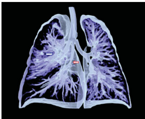
Fig. 1 Three-dimensional reconstruction of computed tomographic images showing the trifurcation with an ectopic right lower lobe bronchus with a bronchomalacic portion (red arrow). There was also a dilated bronchus (blue arrow) distal to an atretic apicoposterior upper lobe bronchus.