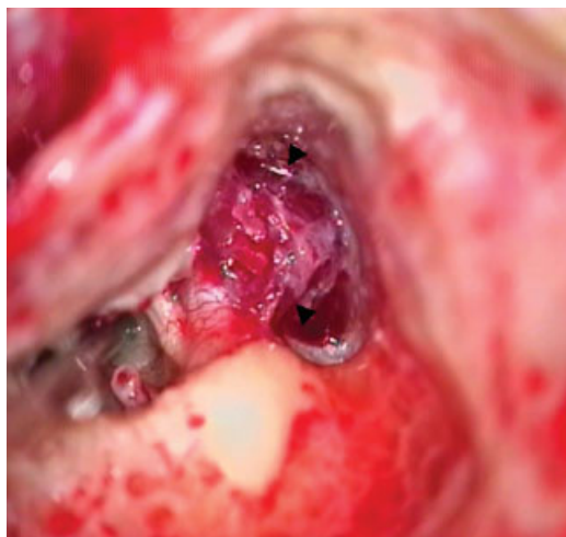
Fig. 2 Intact canal wall tympanomastoidectomy, tumor arising from the geniculate ganglion and the labyrinthine segment of the facial nerve (arrowheads).

numerous vascular spaces were evident with flat endothelium that were compressed by the lesion. Immunohistochemical studies showed abundant positivity of tumor cells for smooth muscle actin and negativity for S100. These aspects were indicative of solid VL (► Fig. 4 ).