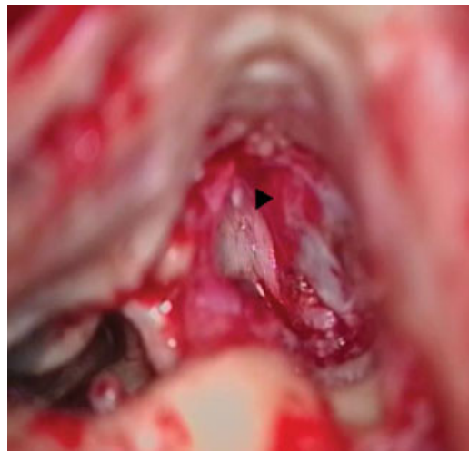
Fig. 3 Intact canal wall tympanomastoidectomy, complete removal of the lesion preserving the integrity of the nerve; the arrowhead indicates the imprint of the tumor on the geniculate ganglion.

VL is rare in the head and neck, Wang et al 4 in a study published in 2004 analyzed 160 patients with VL affecting these sites; only 21 had a tumor localization in this area. Usually, VL develops in the oral or sinonasal cavities, the parotid, submandibular region, carotid sheath, and retropharynx. Intracranially, it is very rare. Karagama et al 2 and Pepper et al 3 were the first to describe two cases of VL of the IAC and the CPA.