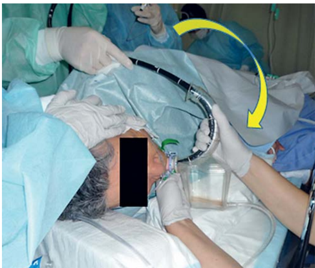
Fig. 3 The patient was rotated to the right lateral position (yellow curved arrow) and endoscopic submucosal dissection was restarted using the Endo Rescue. The endoscope was inserted from the left side of the patient through the Endo Rescue.