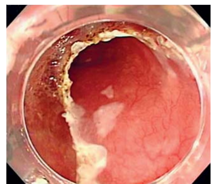
Fig. 5 The procedure time for the dissection of the lesion in the right lateral position was only 15 minutes.

During esophageal endoscopic submucosal dissection (ESD), a left-sided lesion may be affected by the direction of gravity, which causes pooling of water, blood, and tiny resection fragments that obscure the lesion [1]. We used a new inverted endoscopic overtube (Endo Rescue, TOP Co. Tokyo, Japan) to perform esophageal ESD more effectively and safely in left-sided lesions (● Fig. 1).