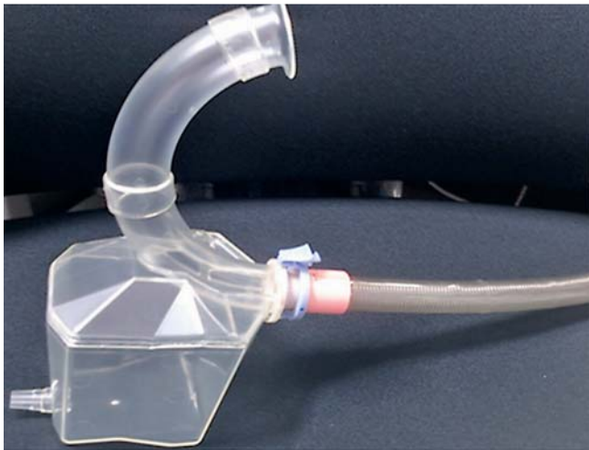
Fig. 1 The outer appearance of the new inverted endoscopic overtube (Endo Rescue, TOP Co. Tokyo, Japan).