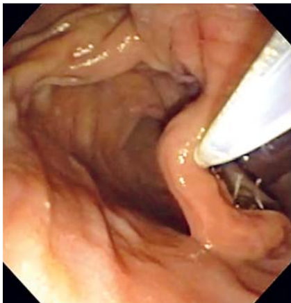
Fig. 1 Endoscopic view of the inverse-pitcher ampulla in a 55-year-old Caucasian woman presenting with ductal calculus.

A 55-year-old Caucasian woman with common bile ductal calculus was referred for endoscopic retrograde cholangiopancreatography (ERCP) after a failed procedure at another facility. Endoscopy revealed a hooded, elongated, inverse pitcher-type diverticulum with an invisible ampulla. The “trunk” of this diverticulum was at least 5 cm long (▶ Fig. 1 ). Multiple attempts by two experienced endoscopists to identify and cannulate the ampulla were futile. Therefore, a linear