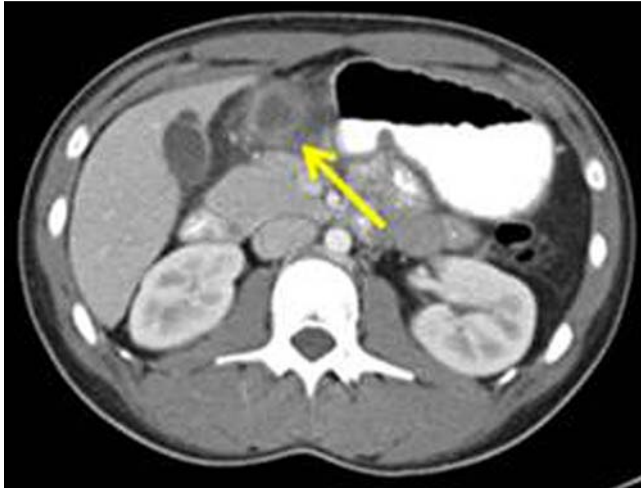
Fig. 1 Computed tomography (CT) scan in a 18-year-old woman with recurrent abdominal pain showing a thick-walled intra-abdominal fluid collection immediately caudal to the pylorus (arrow), consistent with an abscess.

Gastric diverticula are uncommon, usually asymptomatic, and typically present as a solitary diverticulum found incidentally during endoscopy [1,2]. Occasionally, gastric diverticula cause symptoms, including pain, bloating, epigastric fullness, bleeding, and perforation. Rarely, they are associated with abscess formation [2–4]. We present a case of a gastric diverticulum complicated by recurrent intra-abdominal abscess formation, treated with drainage, antibiotics, and, ultimately, laparoscopic surgery.