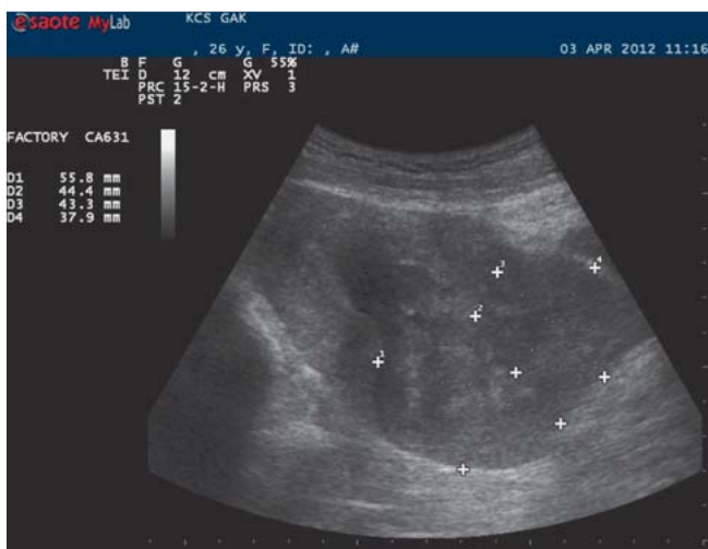
Fig. 1 Preoperative ultrasound finding of extremely large intrauterine mass consisting of two components.