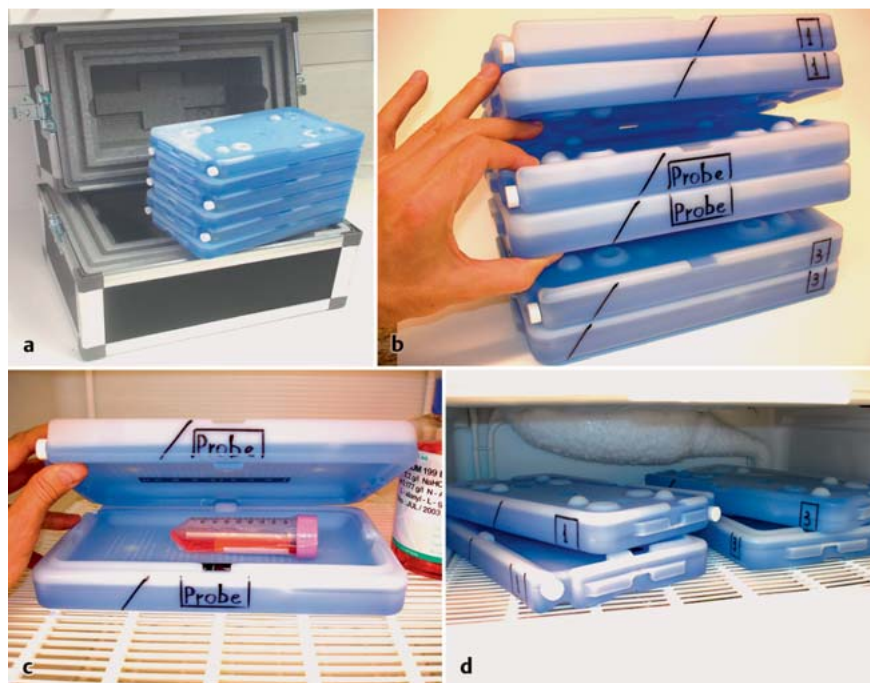
Fig. 1 a to d Transport-set for ovarian tissue. a Complete transport-set with cooling elements. b Three elements: cooling elements 1 and 3 with the middle element containing the samples. c Middle cooling element for samples, cooled to 4°C, with transport medium. d External cooling elements 1 and 3, cooled to -20°C.

is a promising method to preserve fertility in affected women [2, 3]. To date, more than 25 cases have been published worldwide reporting on live births after orthotopic re-transplantation of cryopreserved ovarian tissue. In Germany the first live birth after re-transplantation of cryo-preserved ovarian tissue occurred in 2011 [4].