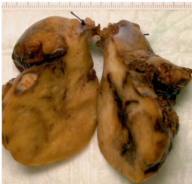
Fig. 1 Macroscopic image of the left ovary showing complete invasion of the ovary (scale in cm).

Cytogenetic investigations showed a break in the area of the c-myc gene with translocation t(8:14) and a clonal immunoglobulin heavy chain gene rearrangement. Histological, immunohistochemical, and cytogenetic findings were consistent with the diagnosis of Burkitt's lymphoma.