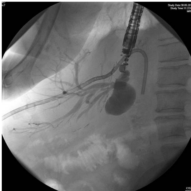
Fig. 2 Fluoroscopy after EUS-guided contrast injection into the efferent loop in a 76-year-old woman with recurrent biliary sepsis showing retrograde filling of the intrahepatic bile ducts and lack of antegrade flow. Note also the additional percutaneous transhepatic drainage in a different liver segment with the tip in the adjacent non-obstructed portion of jejunum.