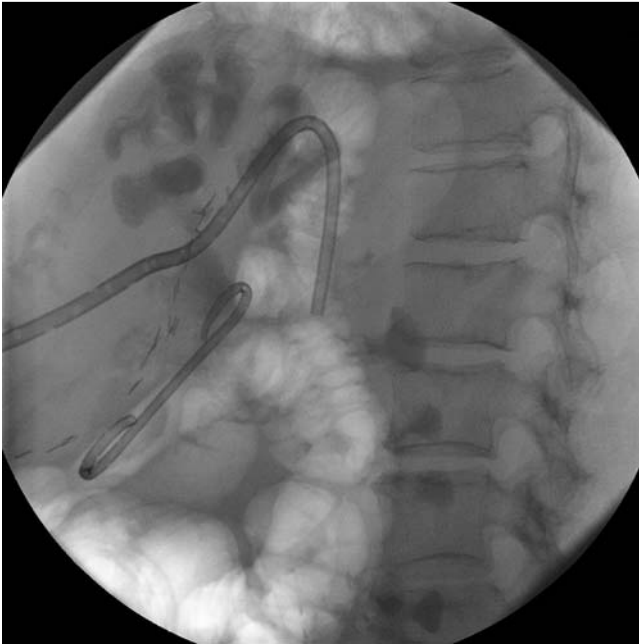
Fig. 4 Fluoroscopic view after successful placement of the transduodenal double pigtail drainage in patient 1.