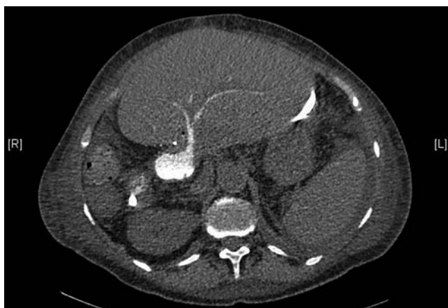
Fig. 3 Computed tomography 1 day after endoscopic ultrasound (EUS)-guided contrast injection in patient 1. The contrast medium is still seen in the efferent jejunal loop.

Hepaticojejunostomy is an established treatment for cholestasis. Complications arise due to obstruction of either the anastomosis or the efferent loop with risk of biliary sepsis. We present a novel approach, transduodenal interventional drainage guided by endoscopic ultrasound (EUS), used in two patients after unsuccessful antibiotic therapy. The first patient was a 76-year-old woman who developed recurrent biliary sepsis ( Escherichia coli ) 4 years after right hepatic trisectorectomy for cholangiocarcinoma with intra- and extrahepatic recurrence 6 months previously. The second patient was a 70-year-old man who also experienced recurrent episodes of biliary sepsis ( Acinetobacter , Enterococcus ) 16 months after surgery for cholangiocarcinoma (extended right hemihepatectomy) with peritoneal carcinomatosis 1 year later.