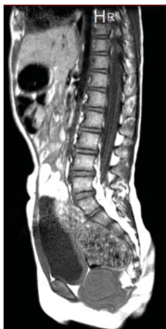
Fig. 2 Tailgut cyst displacing the bladder anteriorly and causing constipation.

polyp. The photo documentation led to more extensive preoperative examination including rectal examination during general anesthesia and a MR scan. The process was easily accessible through a suprasphincteric sagittal incision. Others